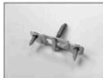
T-Head screw in mounting plate